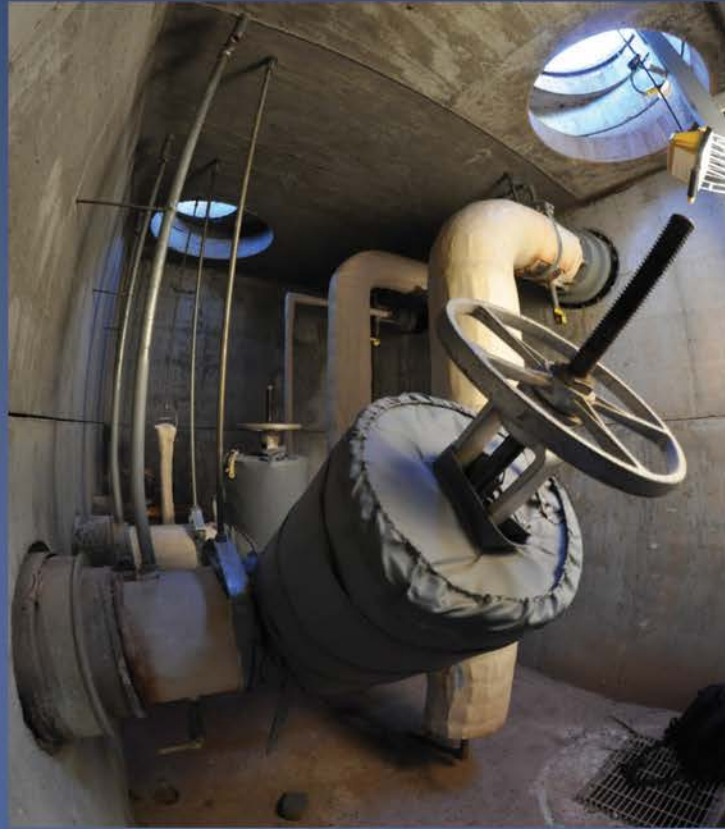
Figure 2: Best Practice Vault at Duke Medical Center—Aerogel Insulation on Direct Buried Pipe, Steam and Condensate Pipe, and Removable Covers

The facilities team estimated each vault's heat loss when fully insulated versus uninsulated: on average, an uninsulated vault costs the university around $4,750/year. When fully insulated, the cost of heat loss plummets to $359/year.