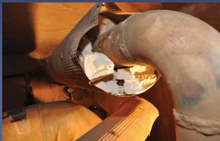
Figure 1: Damaged Insulation in a Steam Vault Adjacent to Duke Medical Center

I had experience with this insulation before joining Duke. I had previously tested the product on a project that required the thermal insulation to work in a trench prone to flooding. Despite the