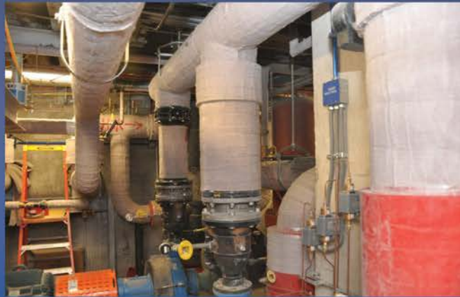
Figure 3: Aerogel Blanket Insulation Was also Used in the Medical Facility Plant Room

In addition to using it in our steam vaults, we have started specifying this material as the primary insulation in our direct buried piping systems. The reduced insulation thickness reduces the outer diameter of the piping system and ensures the insulation will remain effective should a major leak occur. As a side benefit, the reduced outer diameter has also decreased new vault sizes and trench widths, further lowering instal-